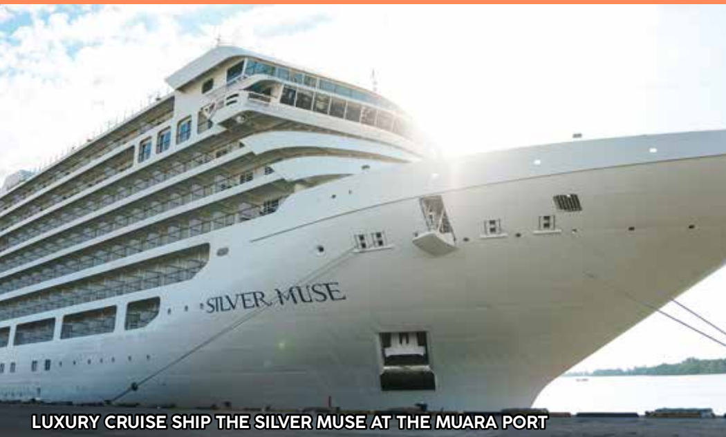
LUXURY CRUISE SHIP THE SILVER MUSE AT THE MUARA PORT