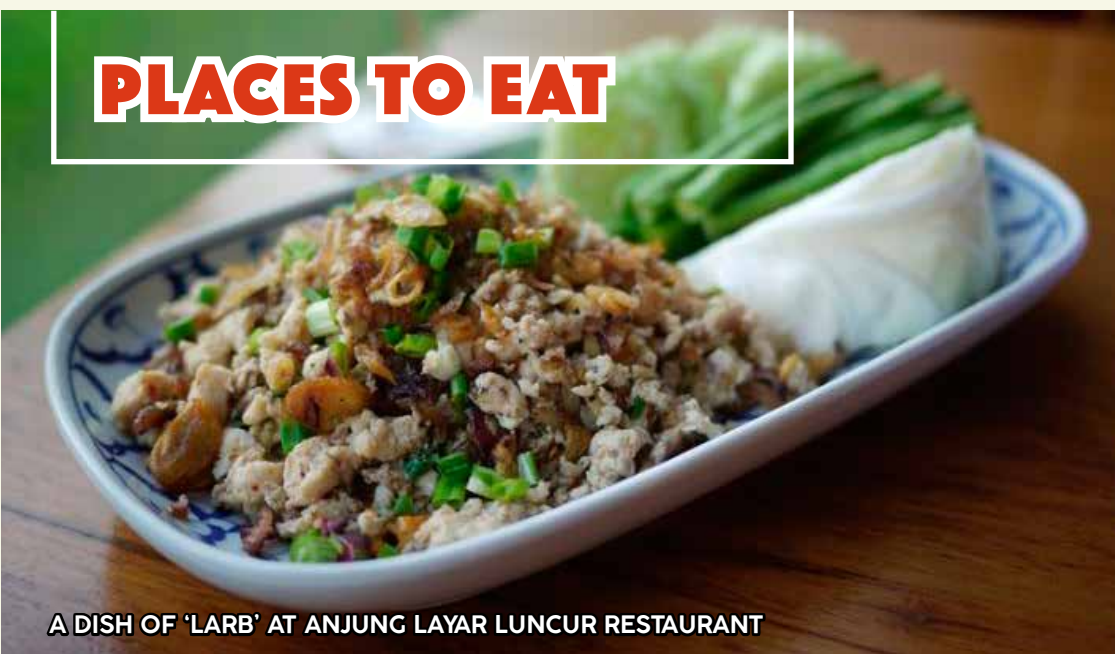
A DISH OF 'LARB' AT ANJUNG LAYAR LUNCUR RESTAURANT

Hungry? There are a variety of restaurants in Muara town to suit your gastronomical needs!