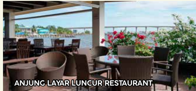
ANJUNG LAYAR LUNCUR RESTAURANT

Serving Northern Thai cuisine, this restaurant is located at Serasa Beach with picturesque views.