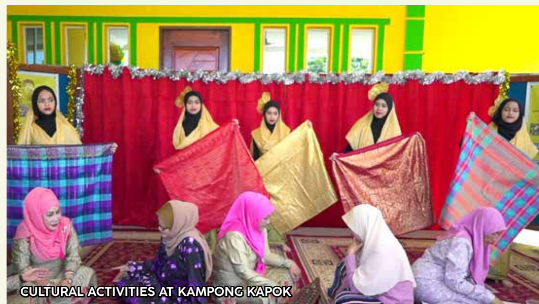
CULTURAL ACTIVITIES AT KAMPONG KAPOK