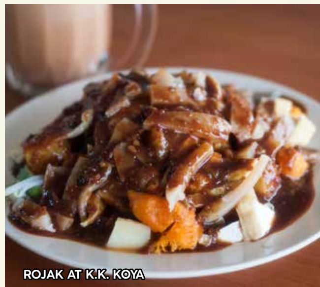
ROJAK AT K.K. KOYA

Originally from Tutong district, dine here for a taste of their famous rojak – arguably the best dish of rojak served in the whole country!