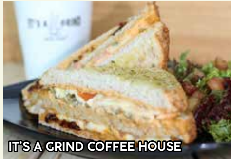
IT'S A GRIND COFFEE HOUSE

#1 Al-Warash Building, Muara Tel: 2772424