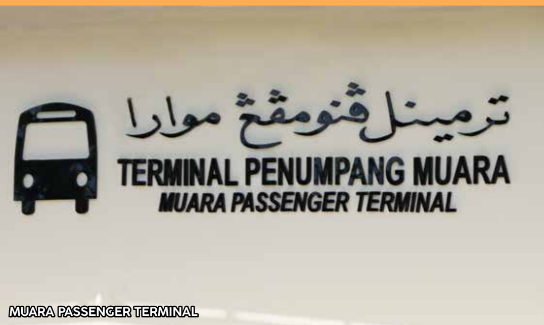
MUARA PASSENGER TERMINAL