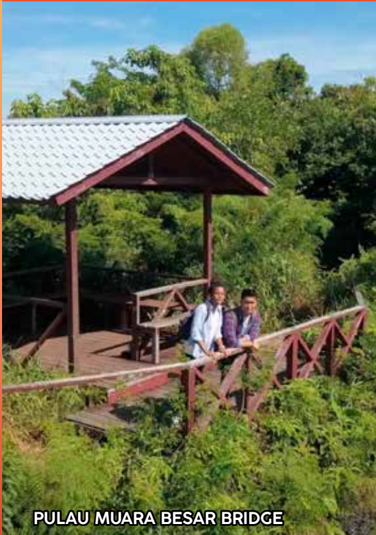
PULAU MUARA BESAR BRIDGE

In Kampong Kapok, these villagers share the joys of a close-knit community life and all visitors are welcomed with open arms.