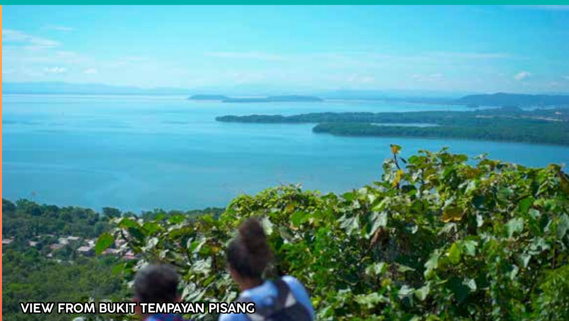
VIEW FROM BUKIT TEMPAYAN PISANG