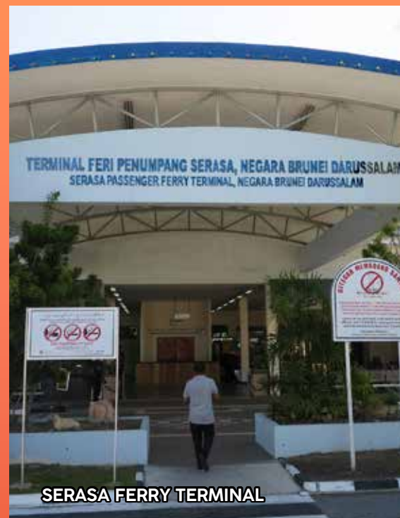
SERASA FERRY TERMINAL

Both passenger and vehicle ferries arriving into Brunei dock at the Serasa Ferry Terminal, which travels to and from Labuan and Kota Kinabalu. Take a bus into Muara town at the bus stop located within the terminal area.