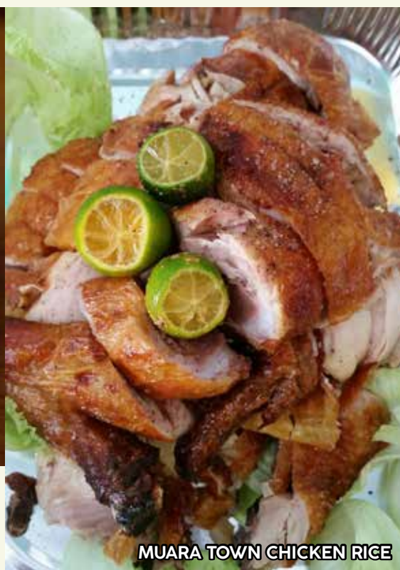
MUARA TOWN CHICKEN RICE