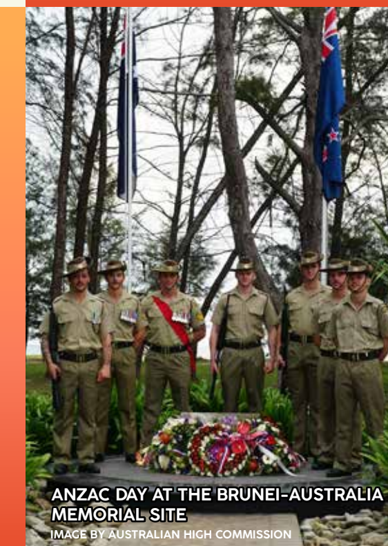
ANZAC DAY AT THE BRUNEI-AUSTRALIA MEMORIAL SITE