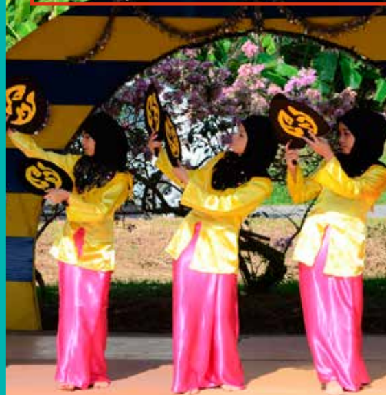
CULTURAL DANCE PERFORMANCE

The grand dame of Kampong Kapok is Bukit Tempayan Pisang – an intriguing hill with its fair share of legends. At 722 meters high, this is a favourite spot for hiking activity due to its challenging yet serene terrain. The trek up to the top will reward hikers with a splendid view of the Brunei Bay, the construction of the Temburong Bridge, Muara Port, Pulau Muara Besar and the residential area of Kampong Perpindahan Serasa. Along the way, you will pass by two interesting caves, which are Radat Cave and Harimau Cave.