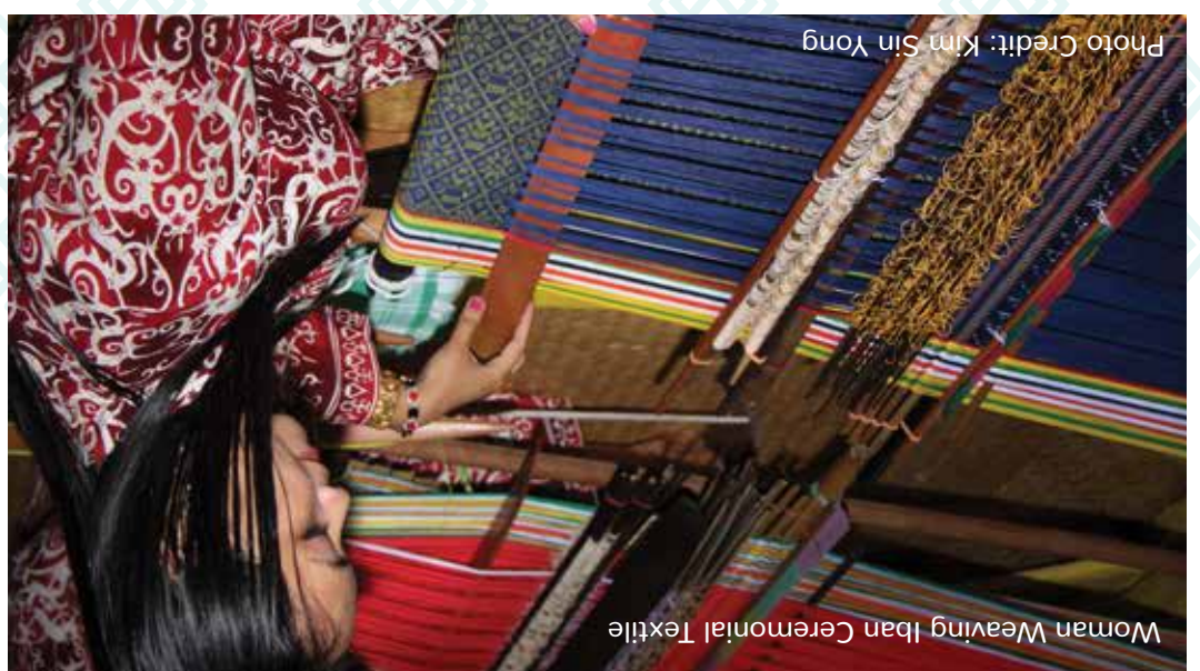
Woman Weaving Iban Ceremonial Textile

DID YOU KNOW? The homes of the Iban tribes are also usually opened around this time to allow visitors a glimpse into their daily life and to join in the festivities which can last up to a month. Labi used to be the main producer of rubber, rice, bees wax and 'jelutong' - a type of soft wood ideal for carving and making patterns. The 1940s saw the first settlement in Labi by the Iban tribe. They built the first remote longhouse in Teraja by the river and the people lived off the land. Preparations for Gawai begin on the eve of the festival with various traditional rituals. Families will gather for a feast and usually opened around this time to allow visitors a glimpse into their daily life and to join in the festivities which can last up to a month. The annual Gawai Festival celebrates the rice harvesting season and to show gratitude to the ancestral spirits for the bountiful harvest. According to folklore, the name Labi (freshwater turtle) whilst he was in Ah Lam, who spotted a 'lae-lae' came from a Chinese native named. The village about 70 years ago. Those who are keen to learn about the accumulation of oil and gas in Labi, Belait way of life of the Iban tribe will be able to find it in Labi, where a small community resides. In 1924, Royal Dutch Shell found some commercialised. The area then turned into a settlement.