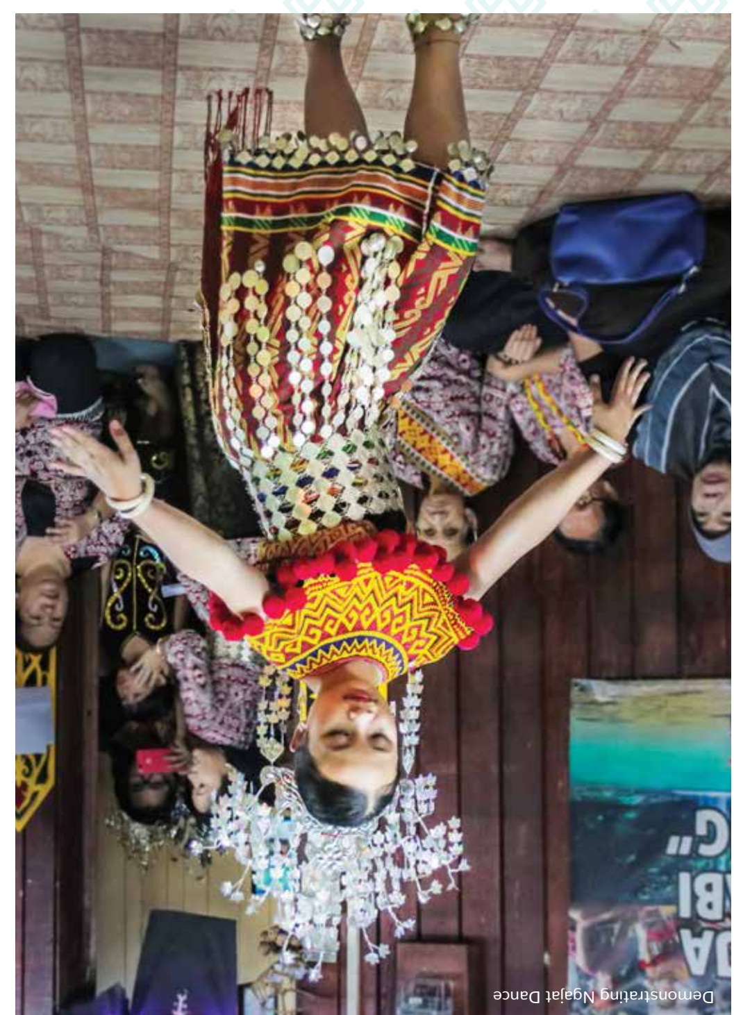
Demonstrating Ngajat Dance