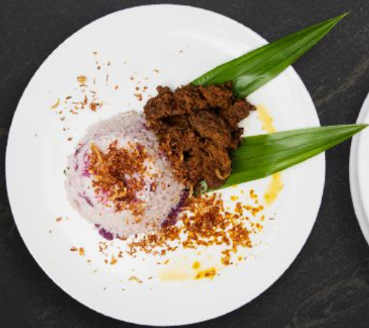
Nasi Bubut Pandan Ubi Manis