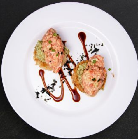
Earth & Sea - Crispy Pandan Infused Pusu Rice, Atlantic Salmon Belly & Pandan Dust