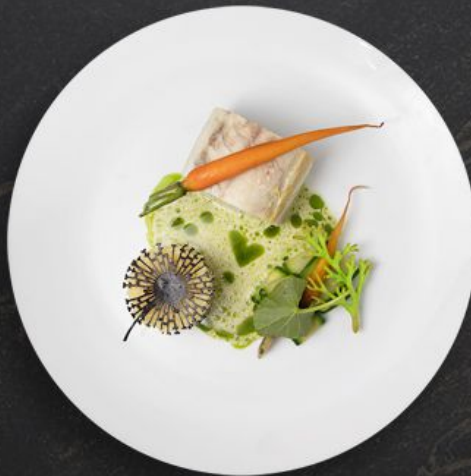
Steamed Seabass with Coconut Lemon Grass with Pandan Oil Sauce