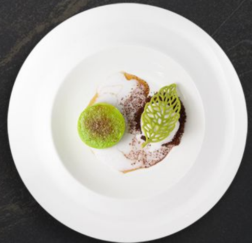
Pandan Brulee with Coconut Ice Cream & Pandan Tuiles