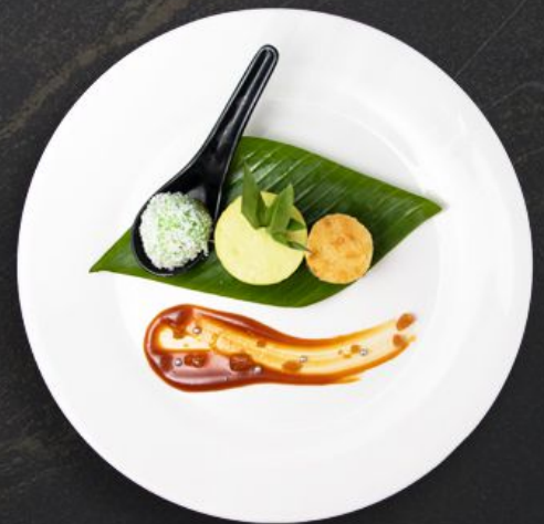
Seri Muka, Bingka Ubi Kayu, Kueh Pancit