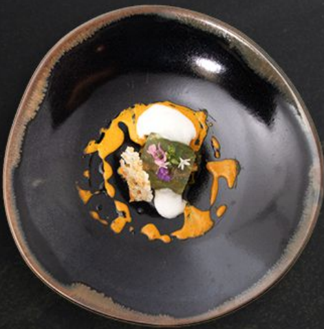
Roll boneless Chicken 'Pansoh' Pandan Rice Crisp Yellow Ginger & Pandan Oil