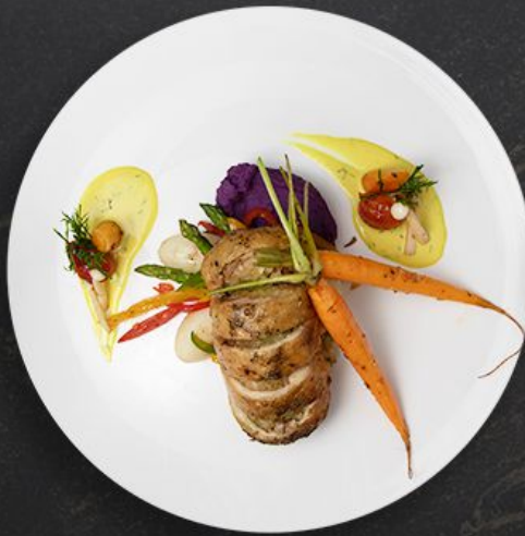
Chicken Roulette stuffed with Pandan Simbada Rice served with Dill Turmeric Cream