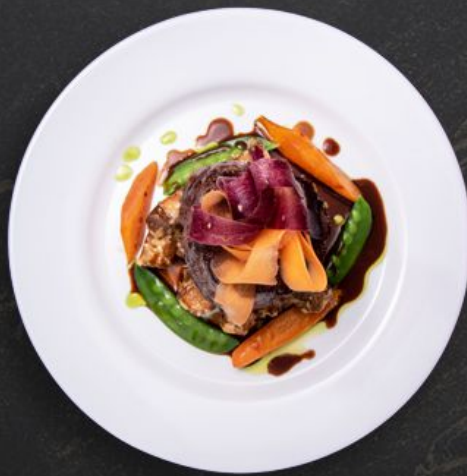
5-Day Dry Aged Beef Filet, Garlic Confit Potatoes & Pandan Smoked Jus Liè