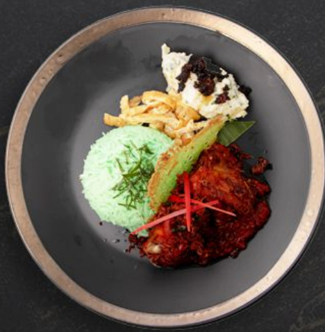
Nasi Katok Pandan