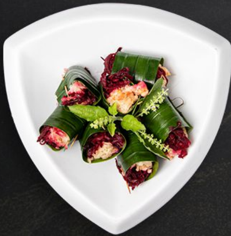
Udang Sengkuang with Pandan Lemongrass