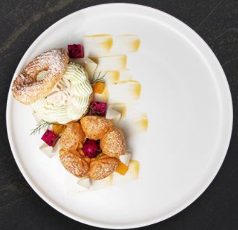
Longhouse Pandan Delight