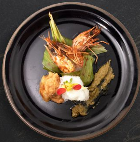
Marinated Tiger Prawn infused with Tamarind & Local Herbs, wrapped with Pandan Leaves served with Fragrant Rice with Pandan Foam & Chiller Preserved Spice Durian Salsa.