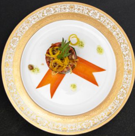
Otak-Otak Daun Pandan