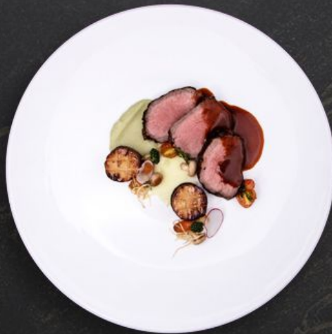
Pan Fried Beef with Special Homemade Pandan Sauce served with Fondant Potato