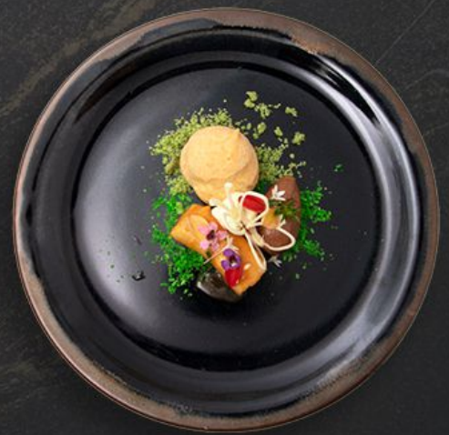
Caramelize Pandan Banana Puff Pandan Crème Chocolate Pandan Mouse