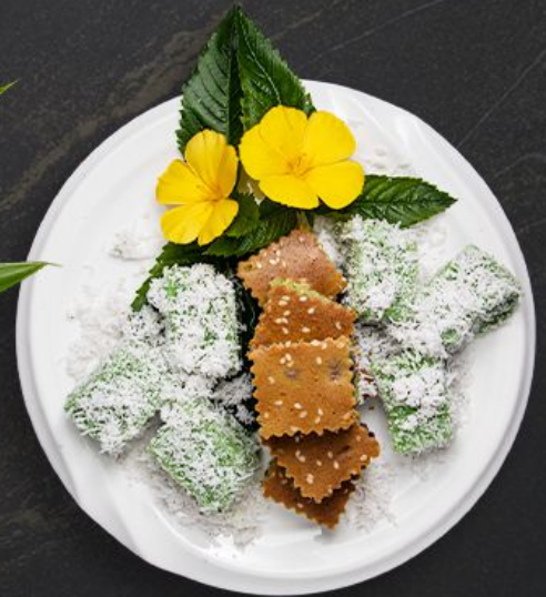
Bingka Pandan Kueh Kaswi Kelapa Pandan