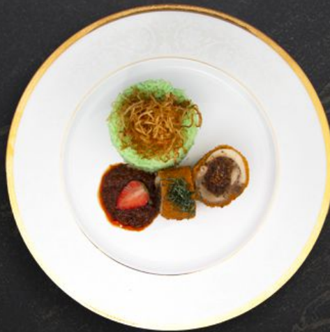
Nasi Pandan Ayam Gulung Sambal Strawberry