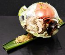
Anatomy of Pandan Chicken