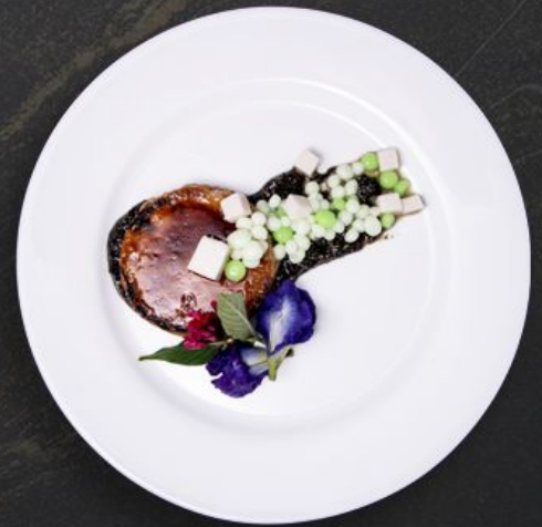
Chai & Pandan Crème Brulee with Kuro Goma Paste, Pandan & Santan Pearls