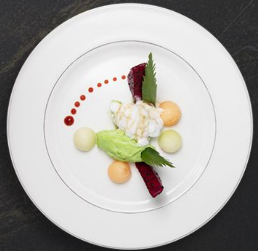
Sum sum Pandan dan Labu Kuning dihidang bersama Gula Melaka dan Buah-buahan Segar