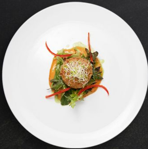
Pandan Belutak Arancini