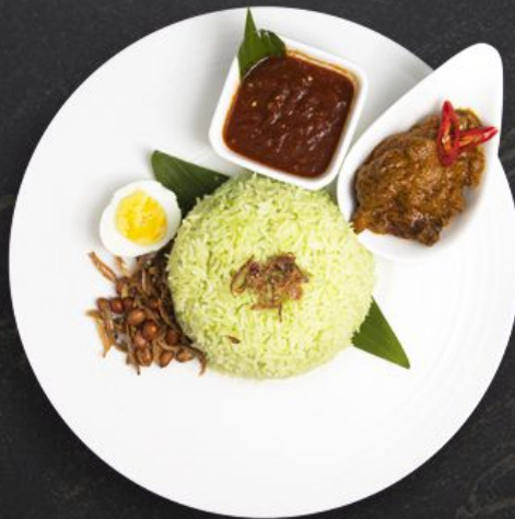
Nasi Lemak with Daging Rendang