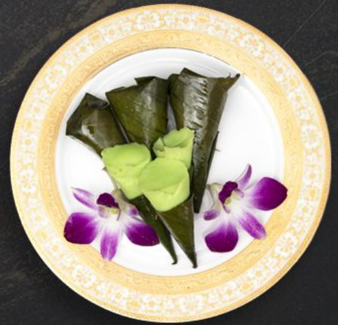
Kuih Basung Pandan