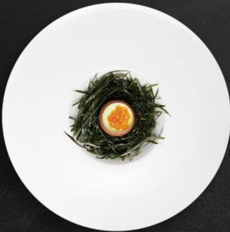
Pandan Chawan Musi with Prawn & Crackers