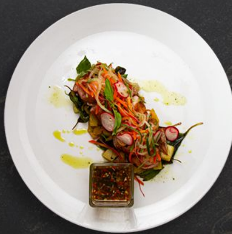
Stuffed Chicken served with Herbal Potato Kerabu & Pandan Vinaigrette