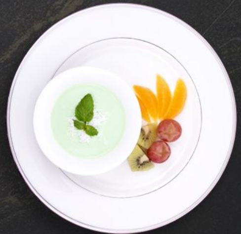
Pandan Panna Cotta