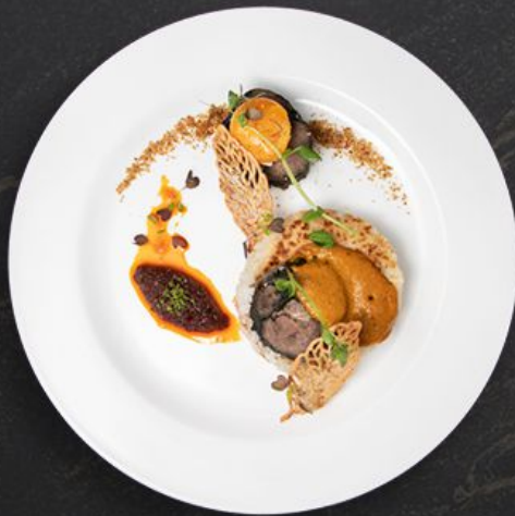
Fundamentals of Pandan