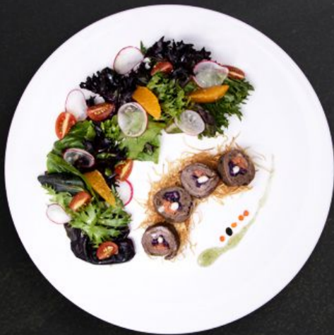
Pandan Beef Roulade & Mixed Salad with Pandan Vinegratte