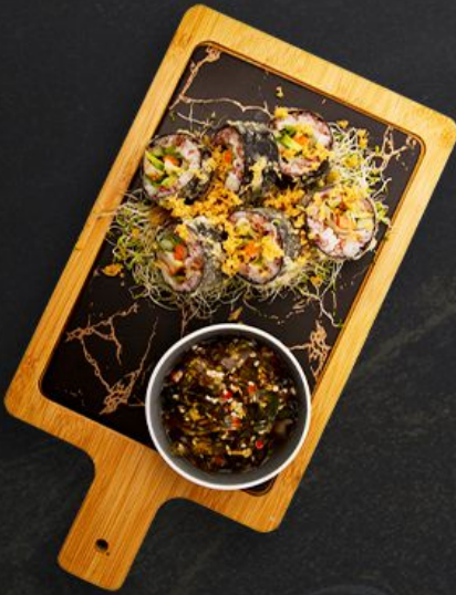
Rice Roll Tempura