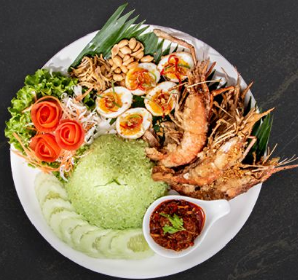
Nasi Lemak Pandan