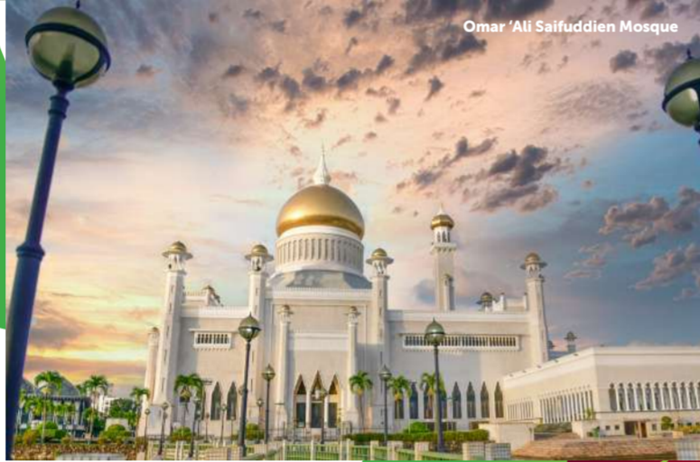
Omar 'Ali Saifuddin Mosque

Jame' Asr Hassanil Bolkiah Mosque Jalan Tutong, Kg Kiarong, BSB To get there: Bus 01C, 20, 22 and taxi