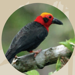
Bornean Bristlehead Pityriasis gymnocephala Peatswamps of Badas Area