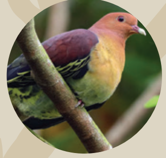
Cinnamon-headed Green-pigeon Treron fulvicollis baramensis Along Badas and the kerangas forests on the southern fringes of Andulau Forest Reserve