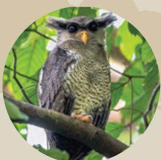
Barred Eagle Owl Bubo sumatranus Badas Road