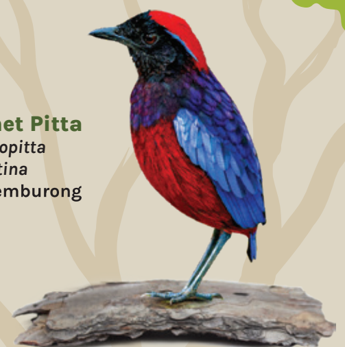
Garnet Pitta Erythropitta granatina Ulu Temburong