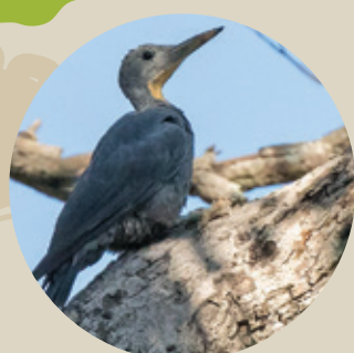
Great Slaty Woodpecker Mulleripicus pulverulentus Badas Road