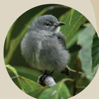
Spectacled Flowerpecker Dicaeum dayakorum Ulu Temburong canopy walk